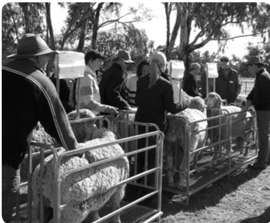
Landholders at in a Ram Select workshop at 'Blue Gate' near Moulamein.

Workshop participants were guided through how to use visual assessment and ASBVs to select the rams that best suited their enterprises and future goals. One key message from the day was: When selecting your rams, focus on three or four main traits instead