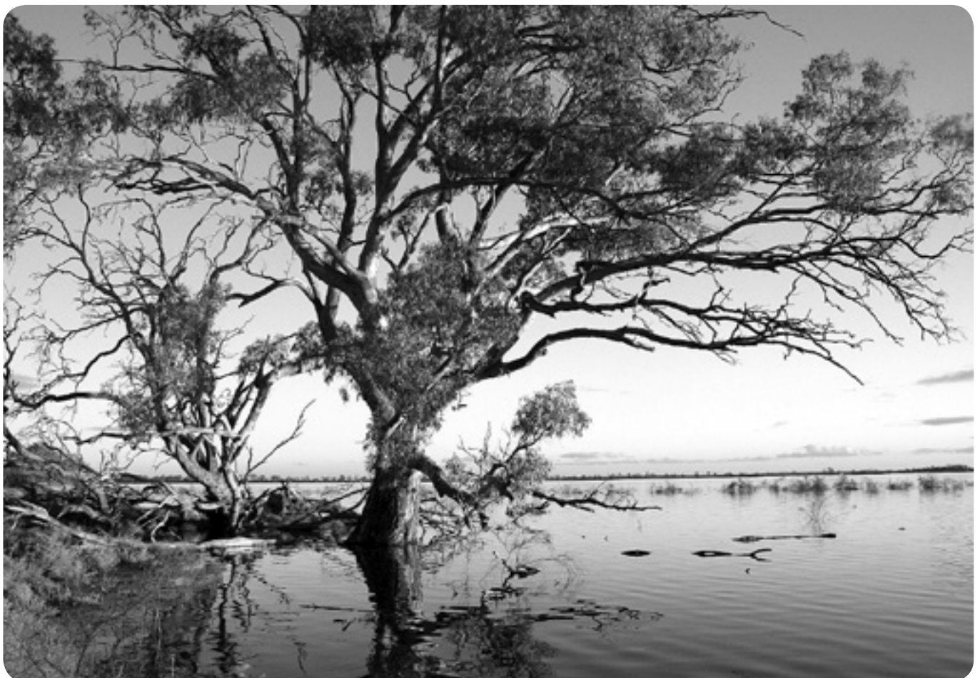
Yanga Lake.

'Wherever possible, NPWS pest control programs are coordinated with those occurring on neighbouring agricultural lands. Larger landscape-scale and integrated pest control programs have a much greater benefit to both the local environment and neighbouring agricultural areas', Mr Neville said.