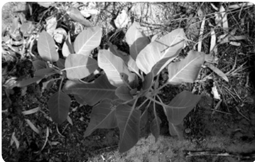
The plants identified near the dead cattle.

stomach contents or other tissue can be tested. Samples of suspect (preferably flowering) plants can also be sent to the National Herbarium of NSW in Sydney's Royal Botanic Gardens for identification.