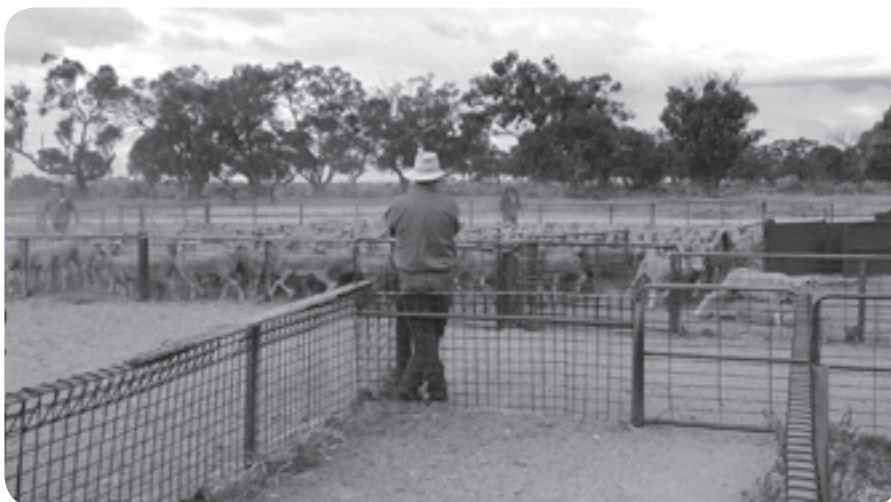
Low Stress Stockhandling Trainer Jim Lindsay coaching workshop participants as they move shorn ewes through a deliberately half-shut gate being blocked by the trainer and by a coat on the gatepost.

At the end of the workshop, everyone agreed that they had learned to move stock efficiently while placing less stress on the animals. They also agreed that these new techniques created a safer work environment in both the yards and the paddock and had the potential to increase overall stock productivity. Everyone at the workshop received a certificate of participation from Low Stress Stockhandling Pty Ltd. For further details about these workshops see their website at: www.lss.net.au .