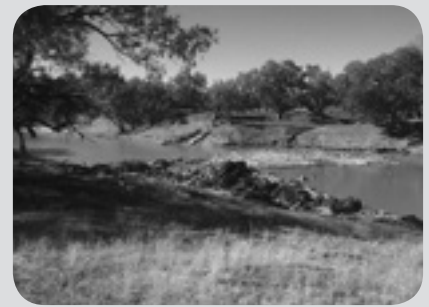
Darling River day use at Karnu Yalpa Many Big Rocks Picnic Area.

More information on the visitor experiences at Toorale is available from the Bourke NPWS office on 02 6830 0200 or from the web at www.nationalparks.com.au .