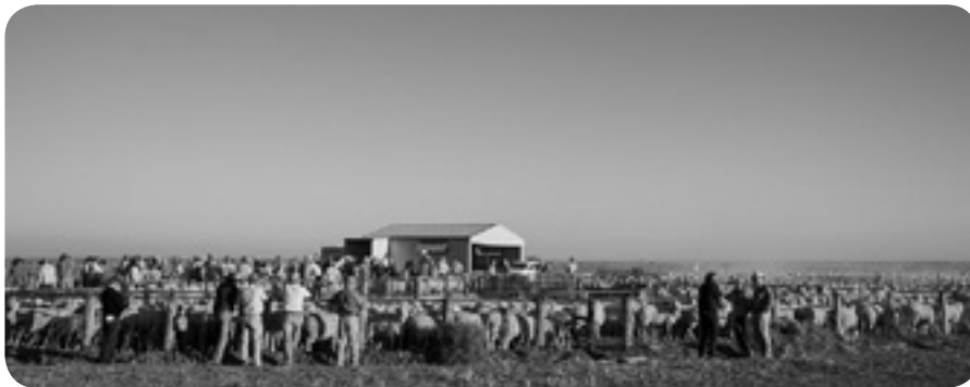
No longer a competition, the Peppin-Shaw is now an open forum focusing on Merino production and profitability. This year it will be held on 3 and 4 March 2015.