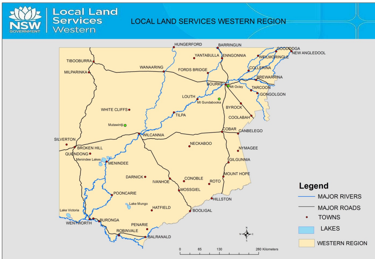
Figure 1: Map of Western Region.